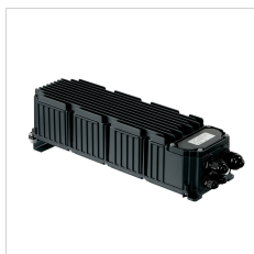
3109421 Driver box 1500 - 1,4 A - 3 CH - DALI